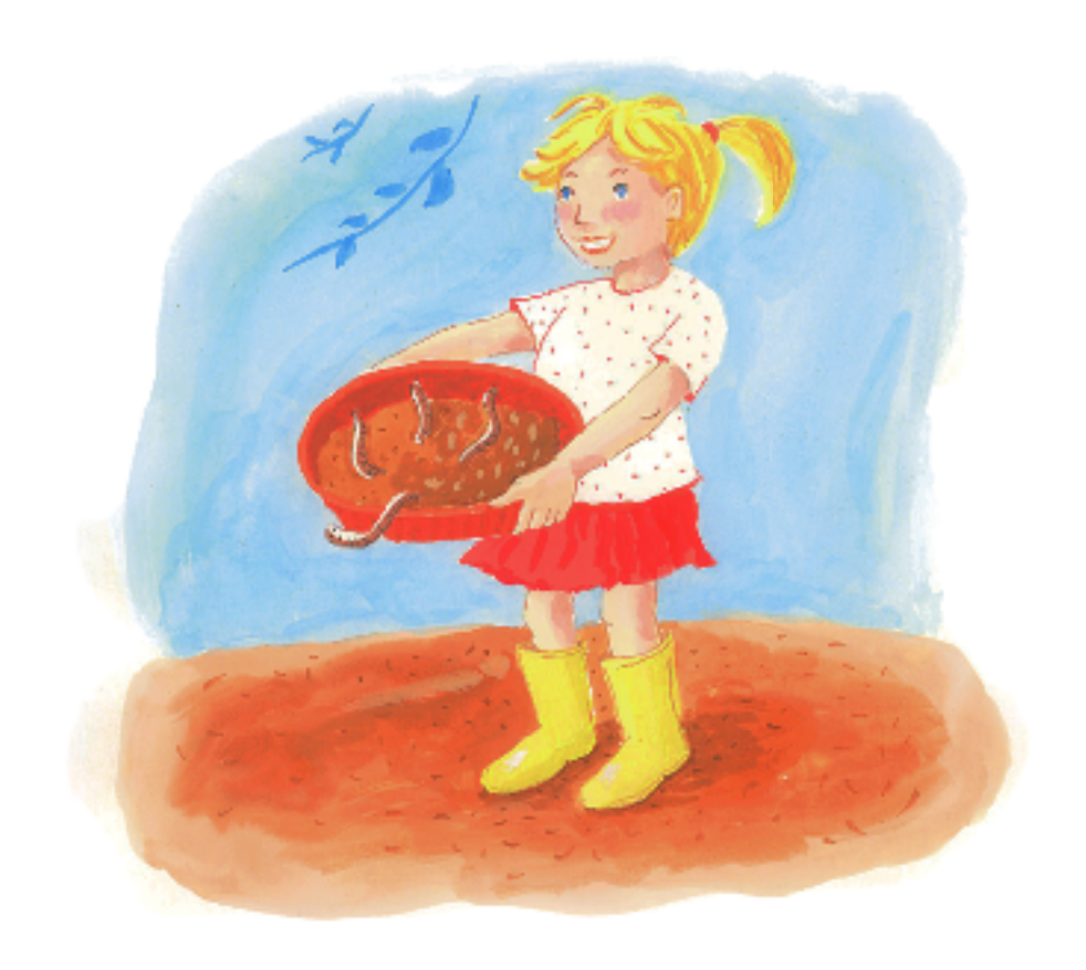
■ "But I made a worm pie!"