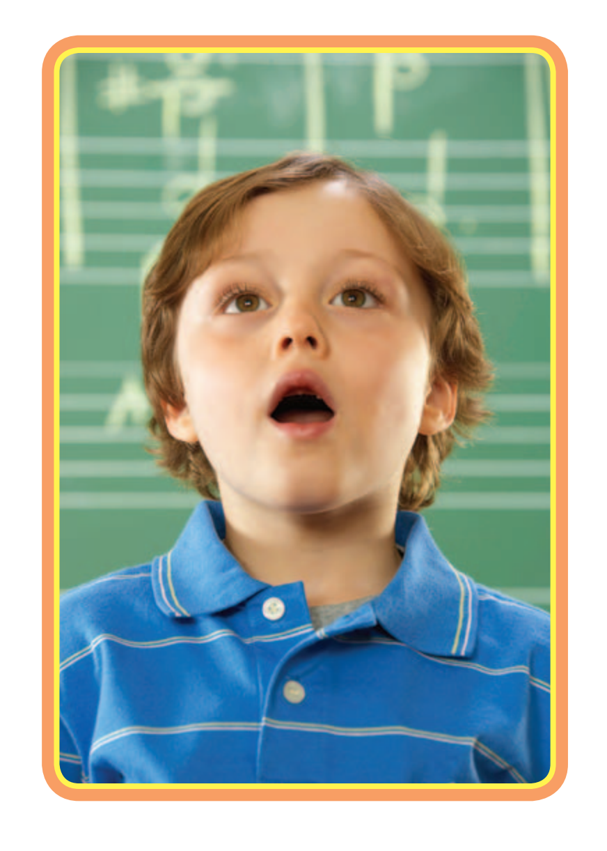
■ I can sing.