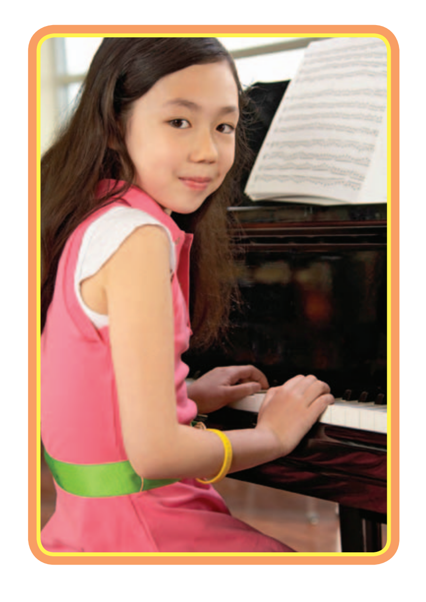
■ I can play.