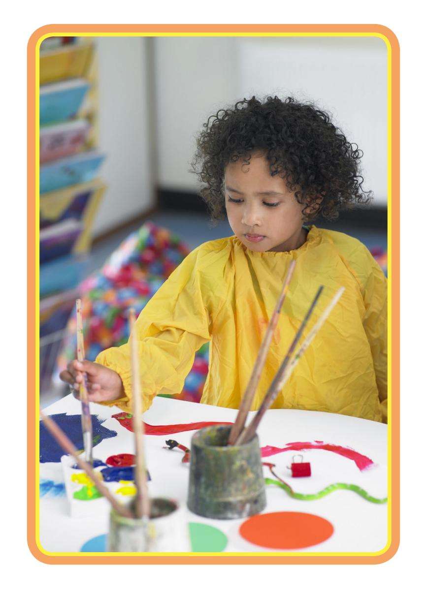
I can paint.I can do a lot.