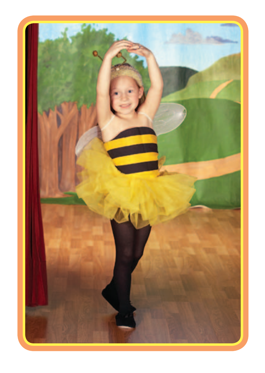
■ I can dance.